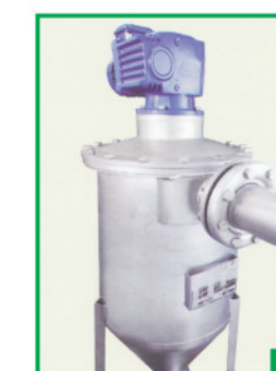
碎毛收集器 Lint collector