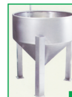
盐桶 Salt Addition Tank