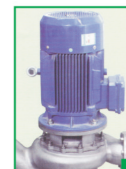
立式离心泵 Vertical Centrifugal Pump